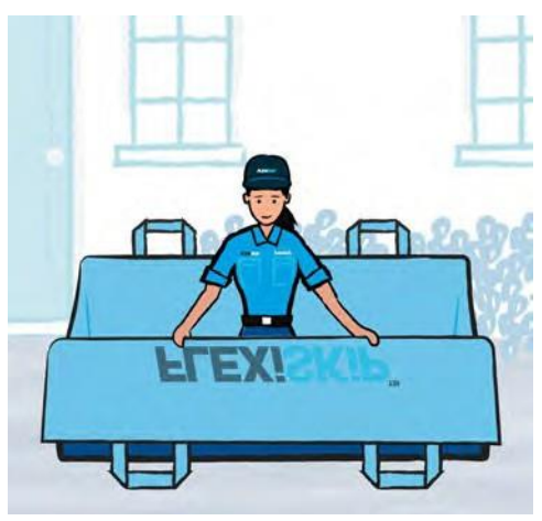
Step 2 - Lift up all four sides and fold one side out and down.