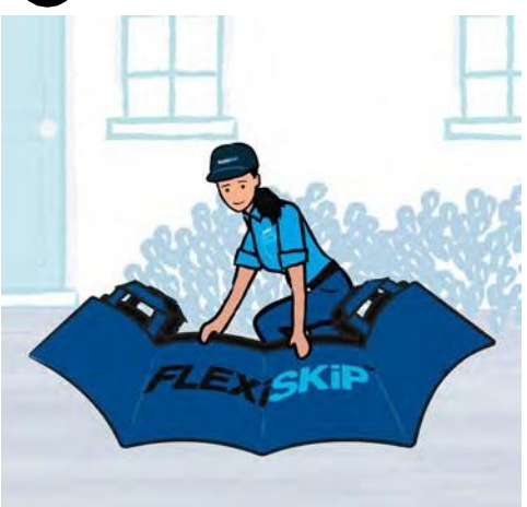
Step 1 - Unpack your FLEXiSKiP and lay it out, ready to be filled.