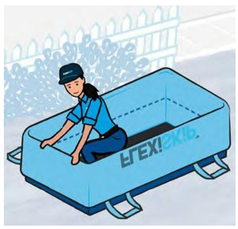
Step 3 - Fold out other sides and push out the bottom corners.