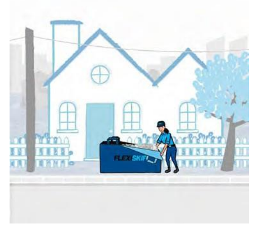
Step 5 - Once half-full, raise sides and place within four metres of the kerb. Check your local Council to see if a permit is needed and make sure FLEXi is clear of any overhead obstacles.