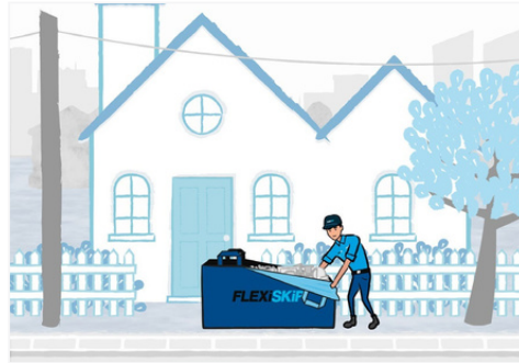
Step 5: Select the Optimal Location

Now, let's start loading up your FLEXiSKIP! It's best to begin with heavy items such as household appliances, timber, furniture, tiles, and bricks. If you're not filling it at the kerb, consider filling it partially to ensure it's not too heavy to move.