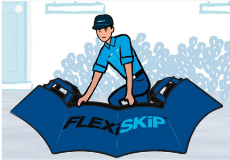
Step 1: Unpacking and Preparing Your FLEXiSKIP

Welcome to your decluttering adventure with FLEXiSKIP! Begin by finding your FLEXiSKIP in its satchel. Then, unfold it and lay it flat, getting it ready for filling. You can choose to do this at the kerb for a swift filling or select a spot on your property for later kerbside placement.