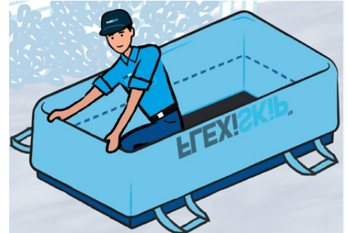
Step 3: Ready to Roll

Now, let's get your FLEXiSKIP ready for action! Climb inside your FLEXiSKIP (we know you want to), lift all four sides, and then fold one side outward and down over itself.