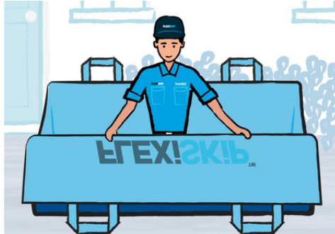
Step 2: Setting Up Your FLEXiSKIP®

Welcome to your decluttering adventure with FLEXiSKIP! Begin by finding your FLEXiSKIP in its satchel. Then, unfold it and lay it flat, getting it ready for filling. You can choose to do this at the kerb for a swift filling or select a spot on your property for later kerbside placement.