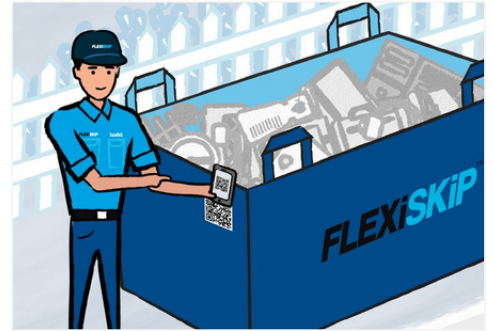
Step 6: Completion and Collection

When your FLEXiSKIP® is about half-full, lift all sides and position it within four meters of the kerb. Be sure to check for any obstructions like powerlines, driveways, pathways, or parked cars. Items left outside of the FLEXiSKIP on the kerb will not be collected. Such items may be regarded as illegally dumped rubbish on public land, subject to local laws and regulations.